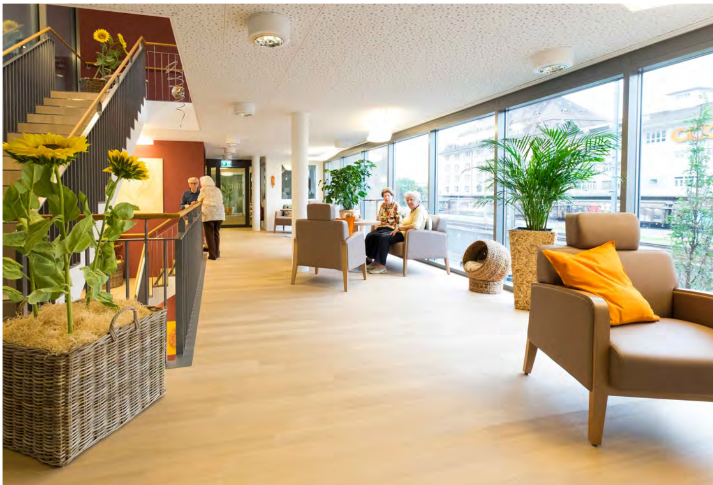
Residents of contemporary retirement villages, such as Senevita Sonnenpark in Pratteln, can enjoy their retirement in a convenient and safe environment.

Consequently, creating living conditions that meet the demands of an ageing population and providing support is increasingly gaining significance. Glutz has analysed the issue in great detail and developed first-class solutions in terms of access systems.